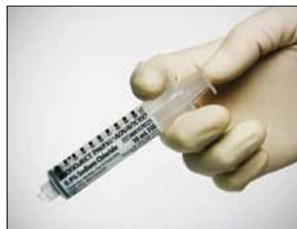
MONOJECT PRE-FILL™ ADVANCED™ Syringe (Tyco Healthcare Kendall)

The other challenge with syringes is the design of the traditional syringe. When all fluid is flushed from the syringe, the tip on the plunger is compressed. To detach the syringe from the catheter hub, the force on the plunger is released and the tip rebounds, pulling blood into the catheter lumen. To avoid this problem, the nurse could leave a small amount of fluid in the syringe. This technique requires learning and practicing a new process, to which busy nurses may not have time to devote attention. The other answer is to use only a prefilled syringe designed to eliminate this plunger-rebound problem. 18 Currently there are 2 brands of prefilled syringes de-